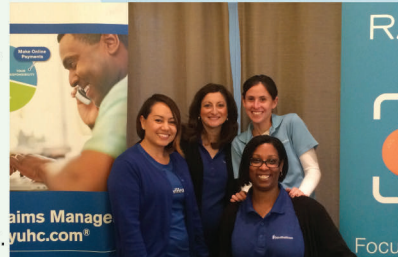
UnitedHealthcare staff at Open Enrollment.

The Fund would like to thank everyone who attended open enrollment. We look forward to providing health programs and activities in the future!