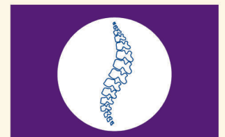
Lower Back Issues 19% of Retirees